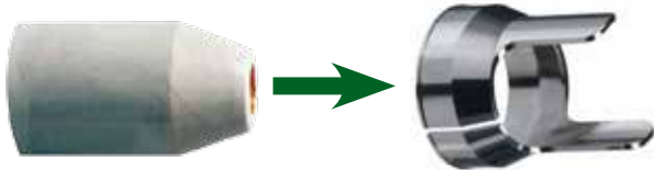
Shield Cup 1 Torch OTD9/8218