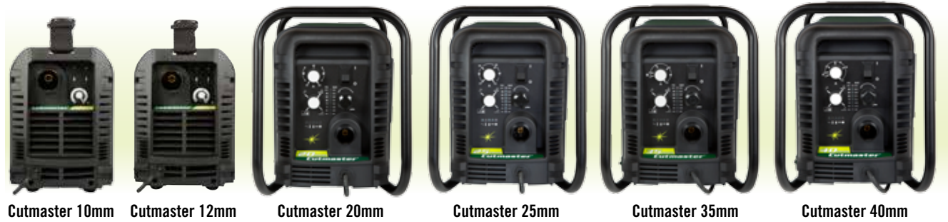
Cutmaster 10mm Cutmaster 12mm Cutmaster 20mm Cutmaster 25mm Cutmaster 35mm Cutmaster 40mm

*Not available on the Cutmaster 10 & 12mm